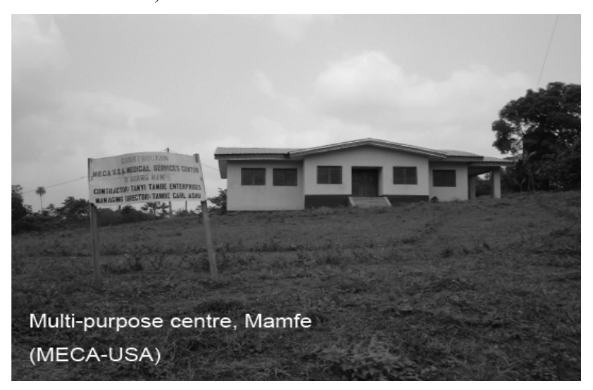
Fig. 2. Mamfe multipurpose centre donated by MECA-USA